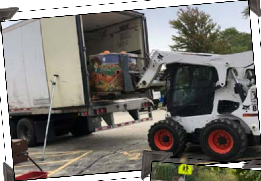
Partnering with Deerfield & Providence Farms Sober Living House to unload pumpkins.

The Pumpkin Patch was a fun place for people to gather outside in a time when we all desperately needed to be together. This year we raised a record amount, and gave half to the Food Pantries.