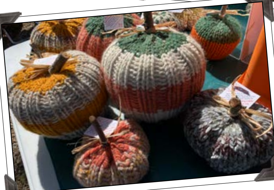
Knitted Pumpkins brought us together and spread hope and joy.