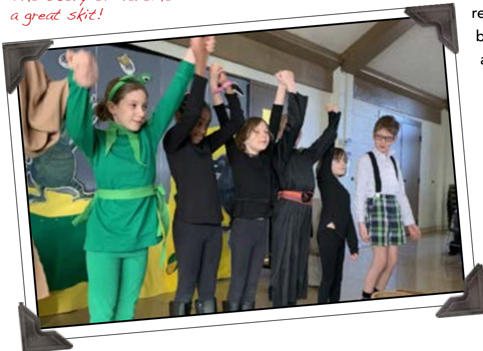
The Story of Jerome - a great skit!

on the sofa, and enjoy remembering how beloved you are as a child of God, and as a part of this community.